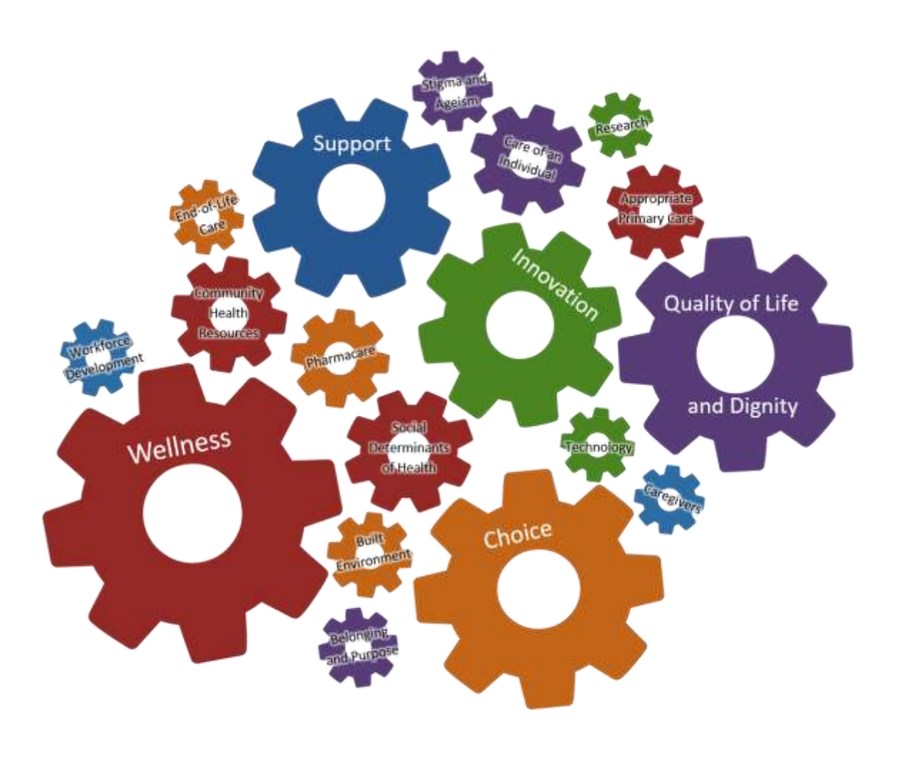
Figure 1. Gears. Depicting the interconnectedness of the five values: wellness, quality of life and dignity, choice, innovation, and support, that underpin the various concepts discussed by stakeholders. These values work together to achieve healthy aging, with each subcomponent making up various sized gears within the greater connected system. The size of the gears corresponds to the importance of each theme as emphasized by the stakeholders throughout the consultation process.