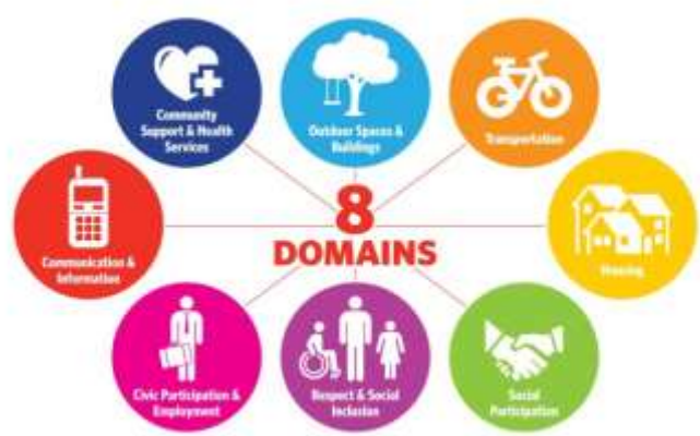
Figure 3. WHO eight age-friendly domains to better meet the needs of older people.

These calls to action align with Canadian advocacy efforts to date, in particular the National Seniors strategy. The national emphasis on this issue emphasizes the timeliness and urgency of action on optimal aging in Canada.